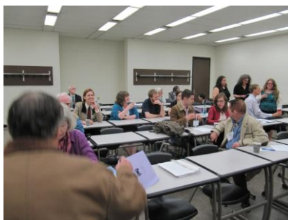
Participants in the KFLC Neo-Latin Symposium beginning to assemble for the final session on Saturday, April 12, 2014.

much they had learned from the papers, presentations and discussions. Participants were also able to interact with one another during coffee breaks and lunch. The Dinner for Presenters (held this year at a Lexington restaurant that features locally sourced food) also provided a relaxed and enjoyable forum in which participants could converse and become better acquainted.