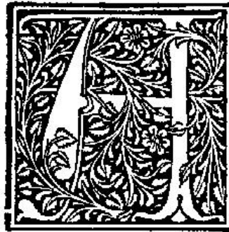
Initial A from Juan de Mena, La Coronación, Seville 1499