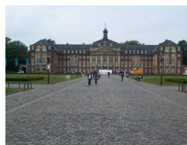
Münster University Castle

The International Association for Neo-Latin Studies (IANLS) holds its international conference on all aspects of Neo-Latin studies every third year. Its XV Congress was held this past August in Germany in the picturesque town of Münster.